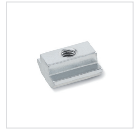
T-nuts to slide in