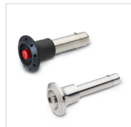
EDDELSTAHL® Rostfrei Inox Stainless Steel