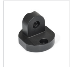
Clamping kit GN 511.1, Type K