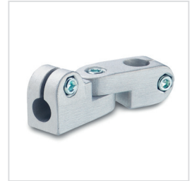
3 Identification No. 2 with 3 Stainless Steel-Clamping screws DIN 912