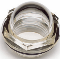
ELESa Original design

Brass nut type GH. (see page 1201) for fitting to reservoirs with wall thickness smaller than 5 mm.