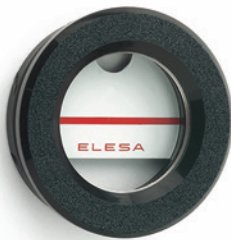
ELESa Original design

Chamfer hole 1x45° and grease slightly the outside surface of the O-ring to make assembly easier.