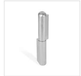
ROSTFREI Inox Stainless Steel