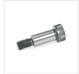
ROSTFREI® Inox Stainless Steel