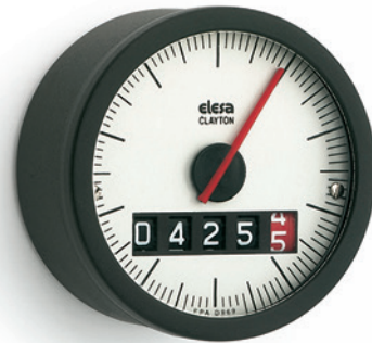
ELESA Original design

These indicators are supplied with a screw on the rear case to prevent the mechanism from rotating during transportation, avoiding any displacement of reading. Before assembling the indicator into the handwheel, remove the screw from the back and fit the self-adhesive element supplied to guarantee IP 67 sealing.