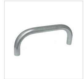
4 Type A simply curved, 90°