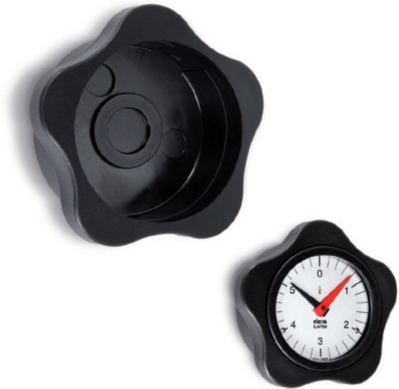
Application example with indicator