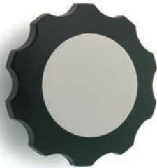
Application example on VHT. lobe knob