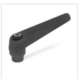
Inch Inch available